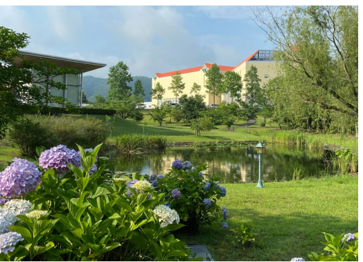
Tokushima Itano Factory of Otsuka Pharmaceutical