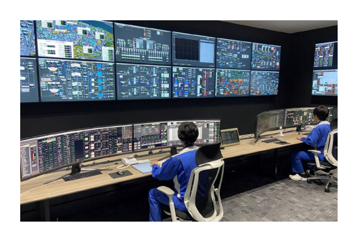
Integrated energy management